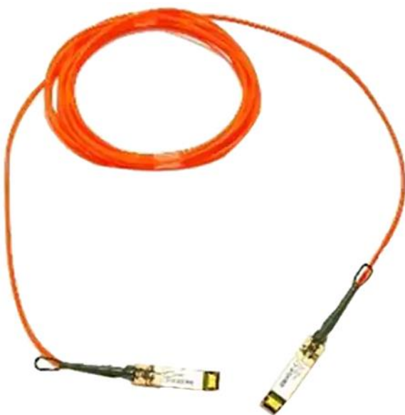
Figure 5. Cisco direct-attach active optical cables with SFP+ connectors

Cisco SFP+ Active Optical Cables (Figure 5) are direct-attach fiber assemblies with SFP+ connectors. They are suitable for very short distances and offer a cost-effective way to connect within racks and across adjacent racks. Cisco offers Active Optical Cables in lengths of 1, 2, 3, 5, 7, and 10 meters.